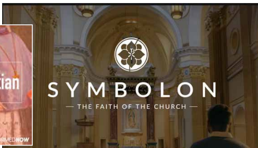
Symbolon: The Faith of the Church